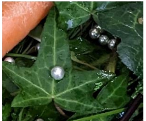
Linda used edible silver balls, as these are the most sparkly edible thing she owns!