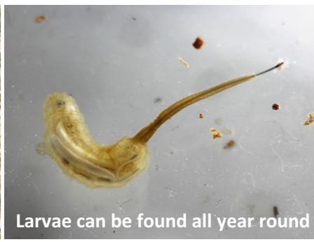
Larvae can be found all year round