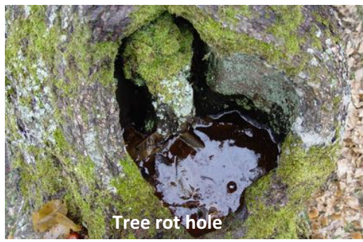
Tree rot hole