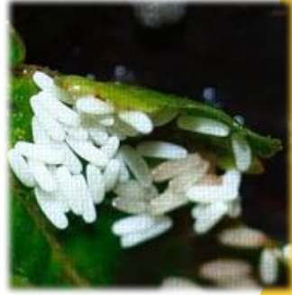
Hoverfly eggs on a lagoon