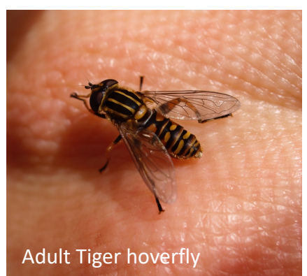
Adult Tiger hoverfly